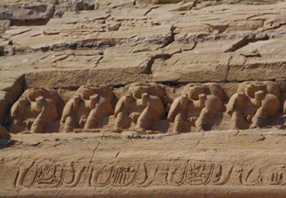
WILKINSON 1992, 57