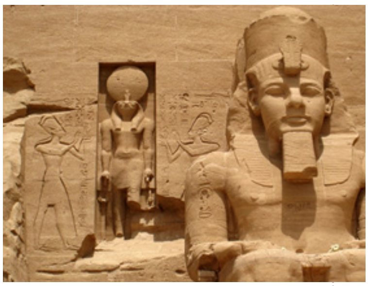
Fig. 1. Ramses II's coronation name above the entrance of the temple

Ramses. The entire temple-complex was nearly covered with sand for many centuries until John Burckhardt discovered it in 1813. The discovery was completed by Giovanni Belzoni in 1817. The two temples were relocated on a higher ground in 1963 - 1968 to avoid being flooded, when Lake Nasser was created.