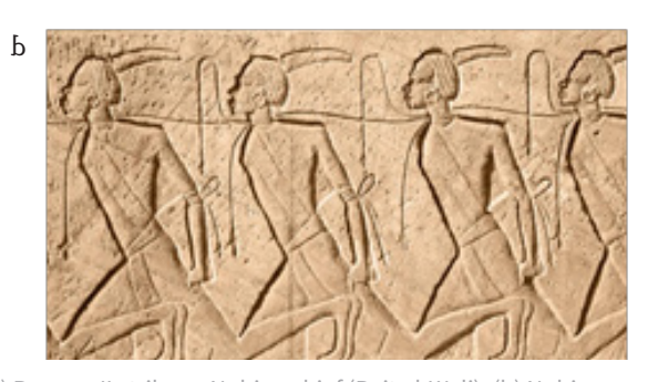
Fig. 4. Nubia in Ramses's Temples: (a) Ramses II strikes a Nubian chief (Beit el-Wali), (b) Nubians providing tribute to Ramses II, (c) Ramses II charging Nubians (Abu Simbel), (d) Nubian prisoners on the base of a seat to the left side of the entrance

ideal formula of stability. This symbol was so meaningful to ancient Egyptian that it had its own festival in the first day of shemu.<sup>52</sup>