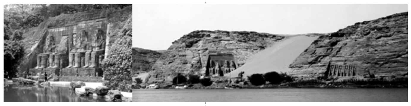
Fig. 2. The temple complex in its original setting in 1904, with a bank of sand separating the two temples.

The temple's interior arrangement is quite unusual because of its many (eight) side chambers. Traces of soot