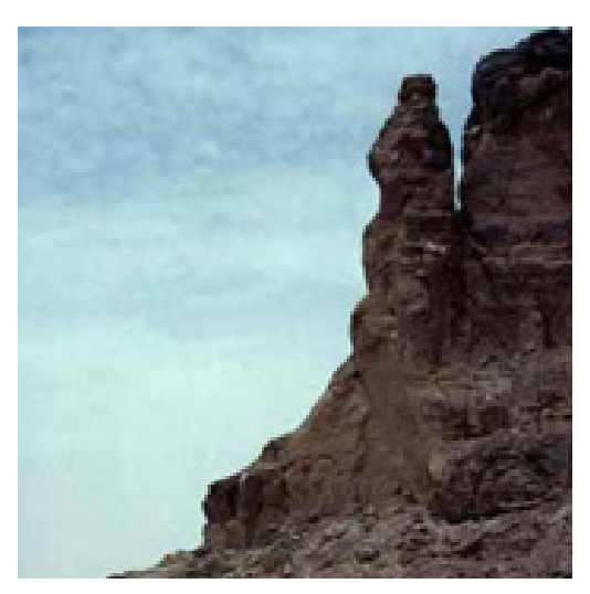
Fig. 5. Gebel Barkal: (left) the pinnacle to the left and the evenly spaced projections and (right) the pinnacle as it appears from the north-east, showing strong resemblance with the Egyptian White Crown