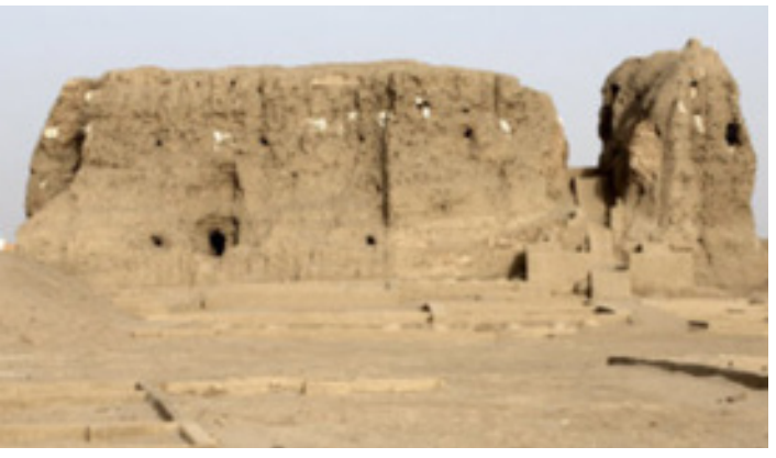
Fig. 6. The Deffufas of Kerma: (left) the Lower/Western Deffufa, and (right) the Upper/Eastern Deffufa